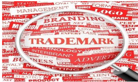
O-3 Notice Mandatory Requirement Prior to Removal of Trademark

Ref: www.livelaw.in, Thursday, 13.06.2019